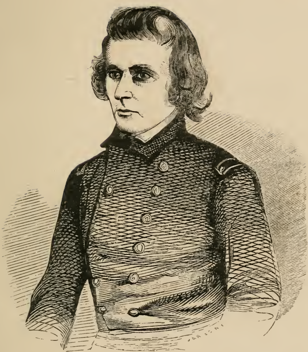
J. C. FREMONT. Lieut. Col. Mounted Rifles.